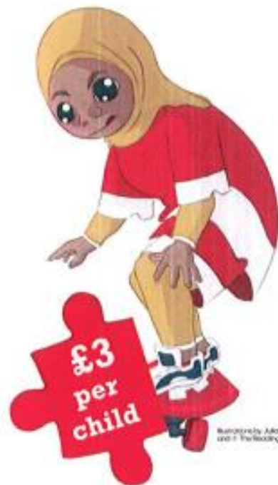
Illustration: Alan Goodall and The Reading Agency 2022